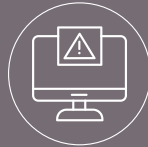
Susceptibility to errors